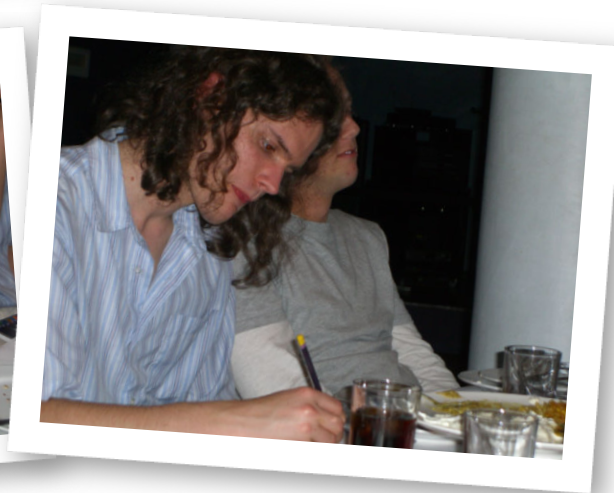
Oh what to write?!