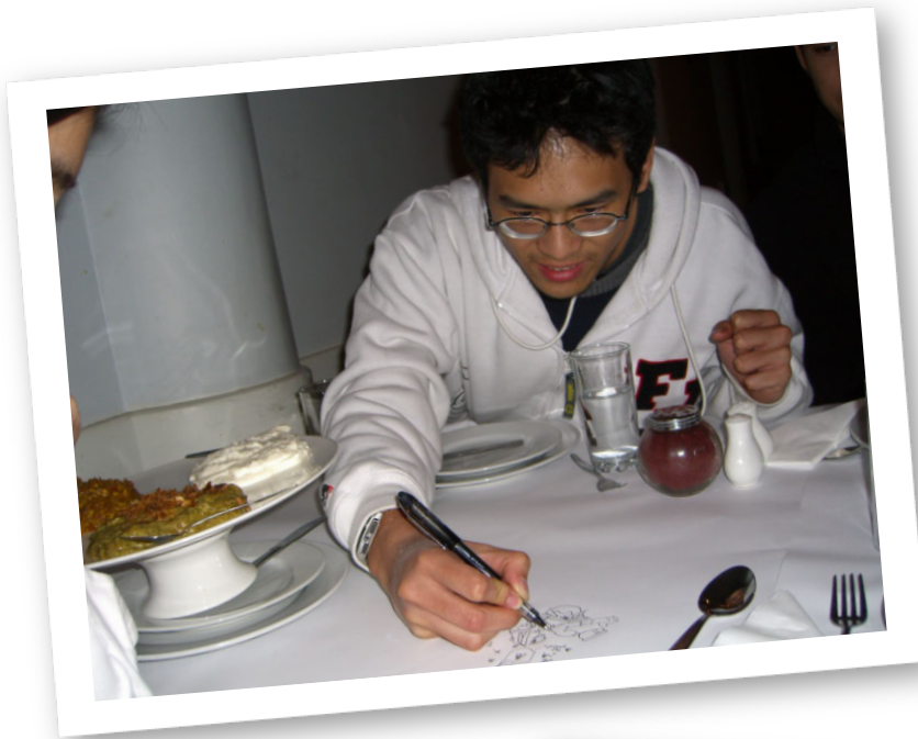
Being the artists that we are, we just couldn't resist drawing on the tables...