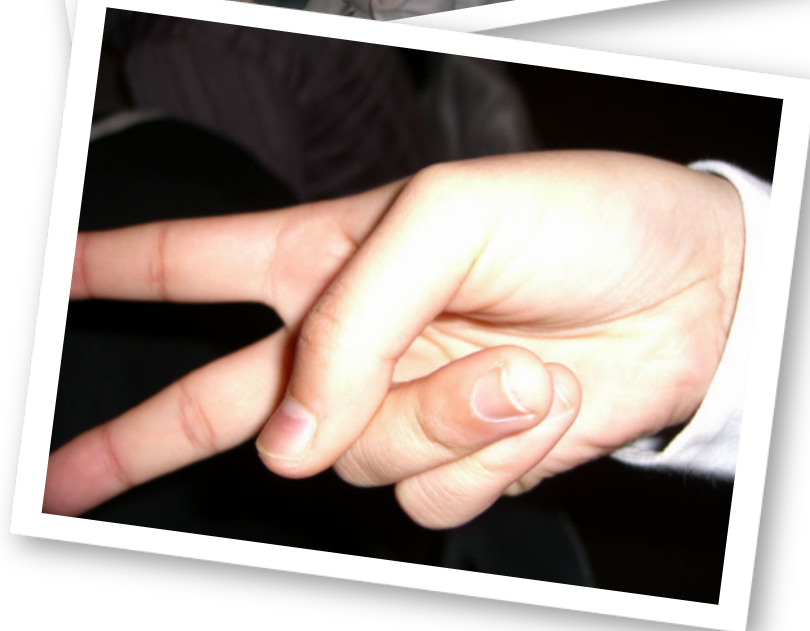
...but who do these fingers belong to?