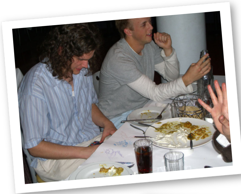
And so the inevitable ritual of signing the card under the table took place...