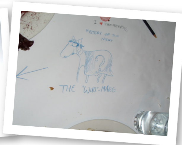
Tim's profound contribution