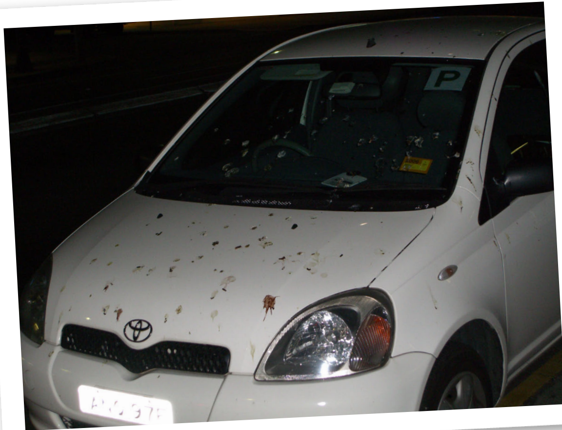
The price to pay for being at a dear friend's birthday celebration