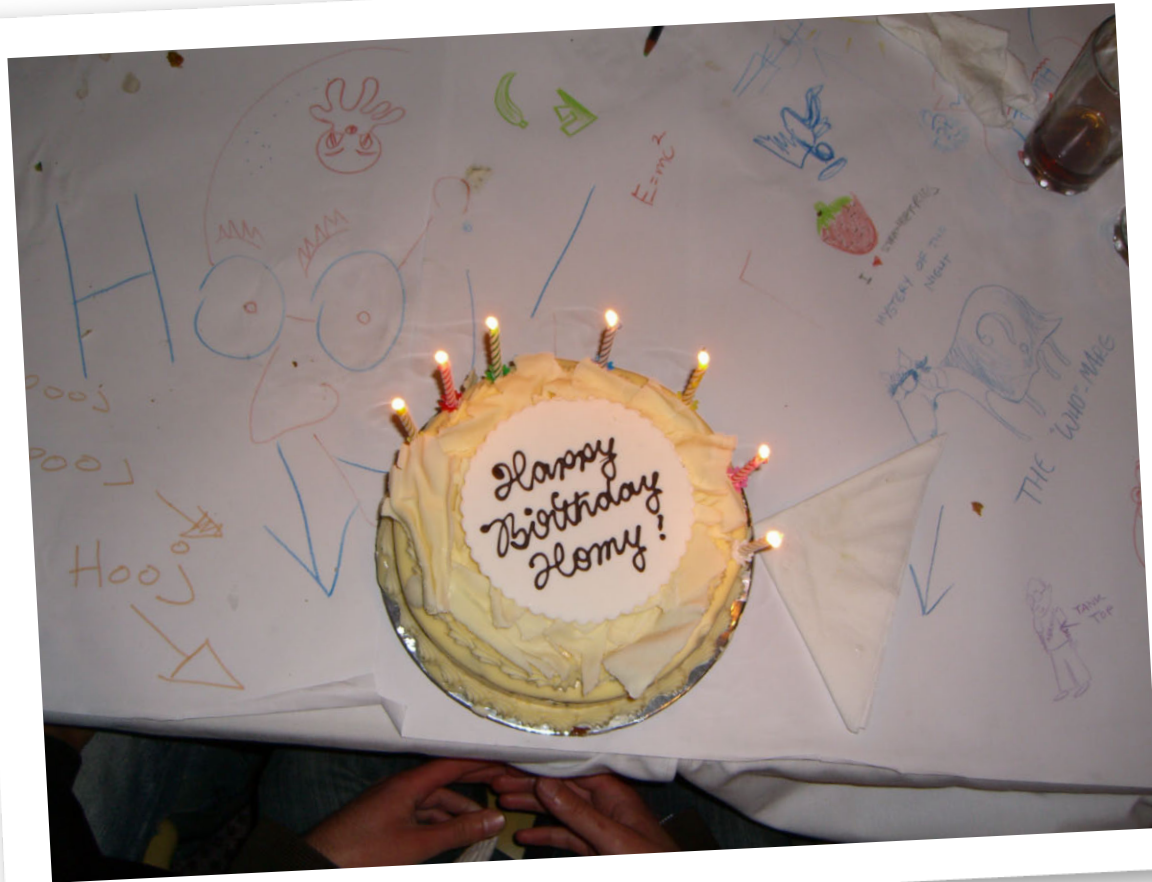
At last... the cake!